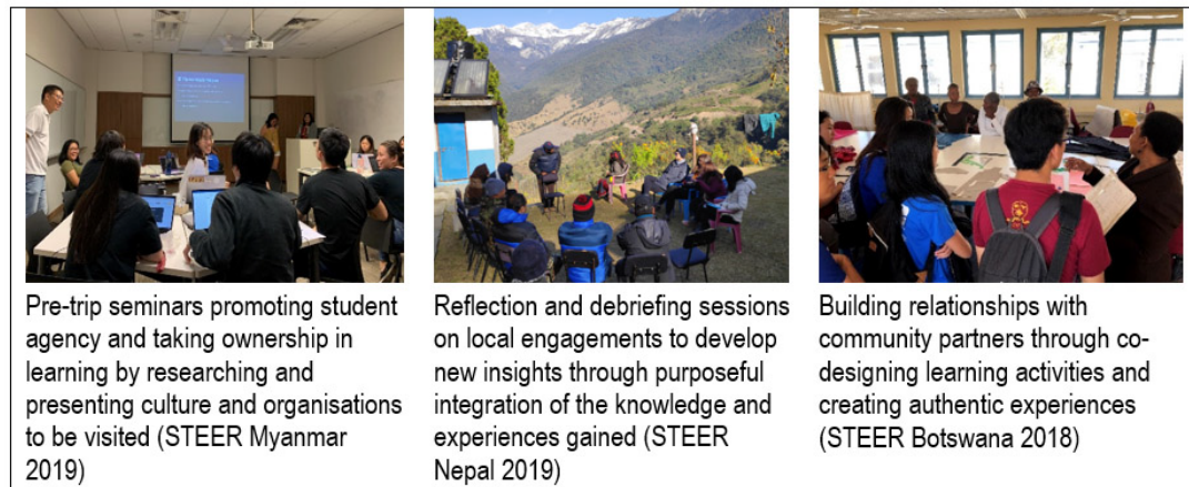
Figure 2. Photos 3 depicting pre-trip seminars, reflection and debrief exercises, and collaboration with partners.