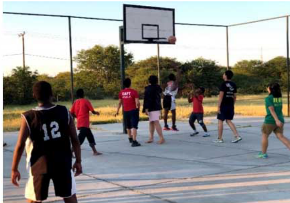
Our students enjoying a game of basketball at Delta Waters International School

[Quotes extracted from post-internship report, STEER Botswana 2018.]