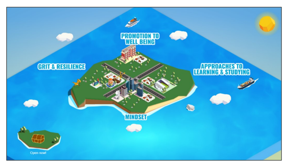
Figure 1. AdventureLEARN's main menu.

When students log in, they can see an island (Figure 1) comprising four quadrants: 'Promotion of Well-being', 'Grit and Resilience', 'Mindset' and 'Approaches to Learning and Studying'. Students have the choice to start learning any of the four topics from the island, depending on their preference or learning needs. For the purposes of this paper, only results from the Approaches to Learning and Studying quadrant is discussed. Students can enter the platform at any time, using either a computer or smartphone. This enabled on-demand access to the platform, providing more flexibility by allowing the students access as and when they require. The platform was made available to all Year One students, accessible through a hyperlink emailed to them.