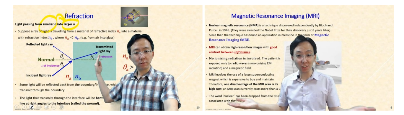
Figure 1. Screen captures of lectures conducted using chroma key compositing with a green screen.

In this work, I propose the use of chroma key compositing with a green screen that allows for the projection of non-verbal behaviours which facilitate lecturer presence and immediacy, and promotes student engagement with the lecturer. This method digitally inserts the lecturer in front of the lecture content, simulating an actual classroom experience and in doing so, improves the lecturer's on-screen presence during remote learning. It is performed in real time using equipment that have in recent years become accessible, in terms of cost and availability, to not only institutions and corporation, but also individual educators.