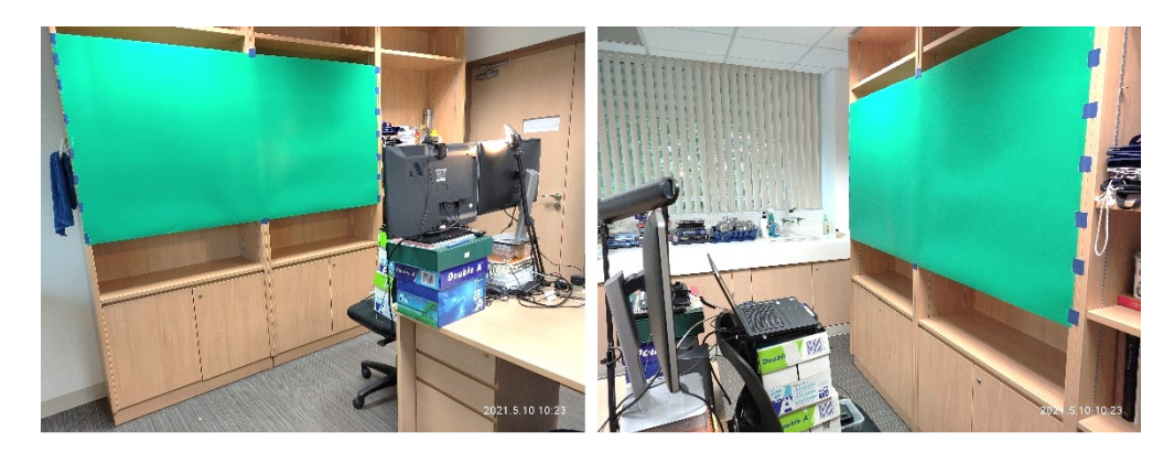
Figure 3. Studio setup used in this work.

The positioning of the physical equipment and software configuration setup require neither prior skill in studio videography nor deep knowledge of video broadcast software. The entire setup process may be completed within a single work day. A basic studio setup was established within an office space at the NUS Department of Physics (Figure 3).