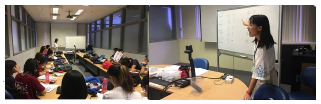
Figure 2. Photo of the students and instructor playing "Game of Truth" during a tutorial.

Rationale for applying "Game of Truth" as an in-class activity . The EGG "Game of Truth" incorporates a gamification element into the session, which aims to get students excited about learning TCM. There are many TCM theories and concepts students would need to memorise. It is hoped that the game's fast and exciting pace would enable students to stay alert and competitive during the lesson, and also help them remember the many TCM theories and concepts embedded in the game.