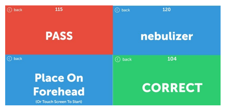
Figure 1. An example of the interface for the EGG "Guess the Terms". The various screens in the app Charade® will be displayed when students are playing the game.