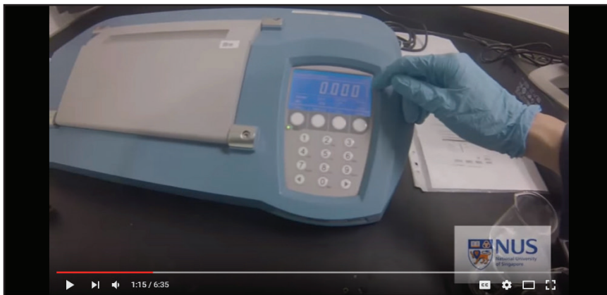
Figure 8a. The GoPro successfully captures the ADP (Click on the photo to go to the video link).

After readjusting the angle of the camera, the recording was redone and it yielded the desired result (Figures 8a and 8b).