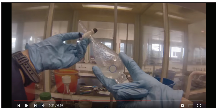
Figure 8b. The GoPro successfully captures the separatory funnel (extraction) scene (Click on the photo to go to the video link).