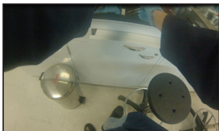
Figure 6a. The GoPro at chest level misses the target as the demonstrator bends over.

Additionally, the height of the demonstrator for this experiment posed another challenge. The upper camera filmed an awkward footage in which the fume cupboard was perpetually out of sight (Figure 6b). There are also times when the demonstrator bent forward to conduct some in-depth analysis of the experiment and the chest camera could only capture unusable shots (Figure 6a). From this experience, it is clear that the demonstrator has to be conscious of the environment and adjust the position of the cameras accordingly. Nevertheless, from the lessons above, the author managed to learn essential tricks to address the challenge.