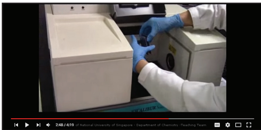
Figure 2a. Third-person view of video recorded demonstrations (Click on the photo to go to the video link).

Flipped classroom and recording videos for teaching has been reported numerous times in the last few years (Davies et al. 2013; Missildine et al. 2013; McLaughlin et al. 2014). Even so, none reported the use of a first-person shooter technique to capture realistic motion images of the lab. Students have given feedback to the author that they have found current video recordings, though clear, to be inauthentic. This is because they are always watching these video recorded demonstrations from the third person's view (Figure 2a). In their own experiments, they would be looking at the setup from a first person view (Figure 2b). Thus this idea of using GoPro to ameliorate online lab teaching was crystallised.