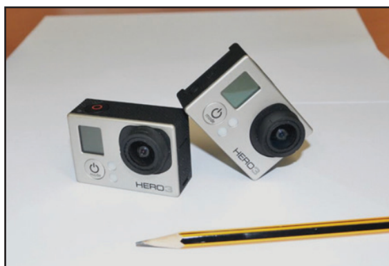
Figure 1. The GoPro HERO3 silver edition cameras.