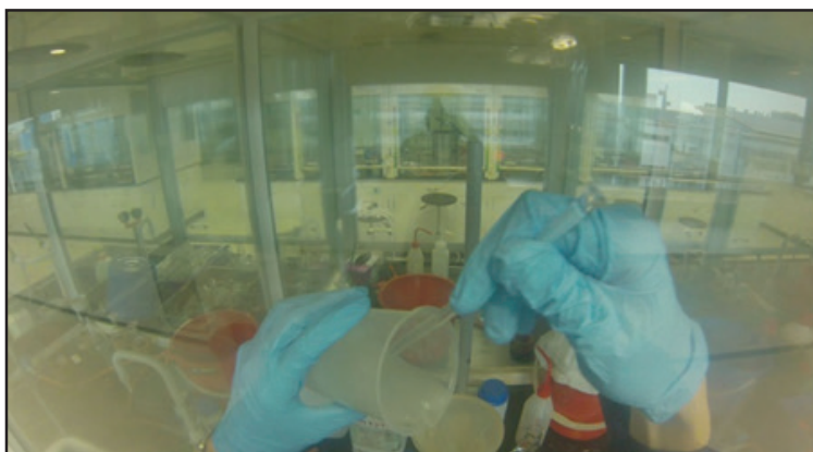
Figure 4. Demonstrator is seated on the stool. The GoPro at forehead level captures only a partial frontal view of the flash column and misses the bulk of the glassware.

During the initial trial, the camera attached to the forehead would miss the bulk of the experimental setup, with only the upper portion of the device being captured (Figure 4). On the other hand, the camera strapped onto the chest provided another perspective. It could only provide a glimpse of the bottom part of the setup (Figure 5).