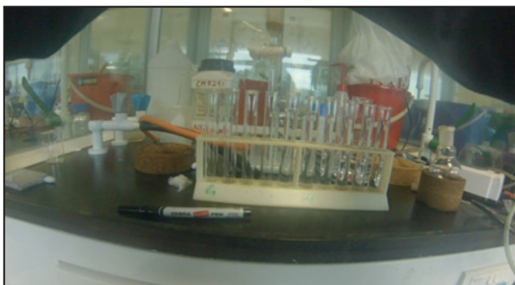
Figure 5. Demonstrator seated on the stool. The GoPro at chest level captures only the lower view of the flash column and misses the big picture.