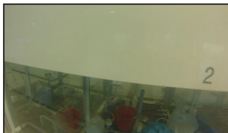
Figure 6b. The GoPro at the forehead misses the target as the demonstrator was standing up to transfer the reagents.