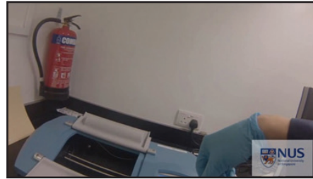
Figure 7b. The GoPro misses the solution transfer scene.

After readjusting the angle of the camera, the recording was redone and it yielded the desired result (Figures 8a and 8b).