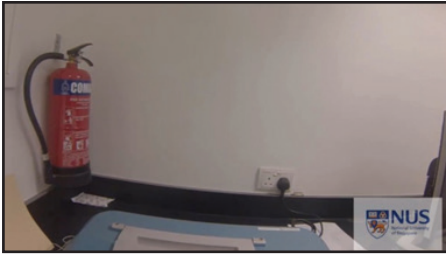
Figure 7a. The GoPro misses the ADP.