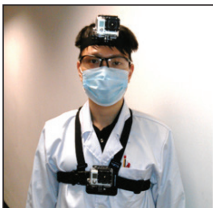
Figure 3a. The demonstrator wearing two GoPro cameras.

Using the GoPro camera to record FPV videos, however, solves the aforementioned problems. In this trial, the demonstrator wore two GoPro cameras; one strapped onto the forehead (Figure 3a), the other strapped onto the chest (Figure 3b).