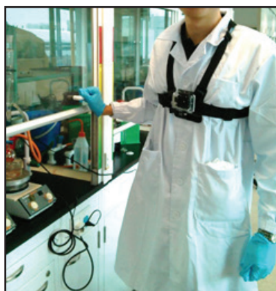
Figure 3b. The demonstrator standing beside the chemistry fume cupboard.