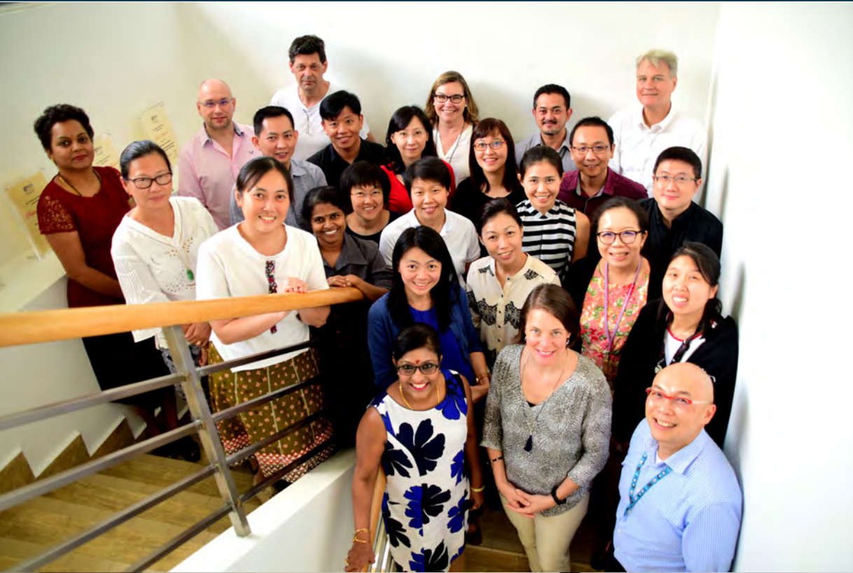
Lund-Singapore Strategic Academic Development Course (Jan-Oct 2018)