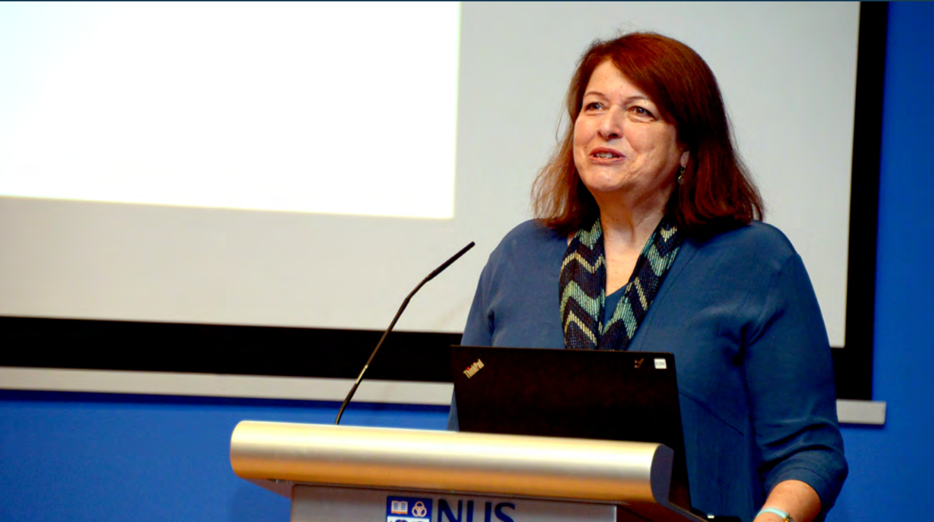
8th Teaching and Learning in Higher Education (TLHE2018): Campus Conference (25 Sep 2018)