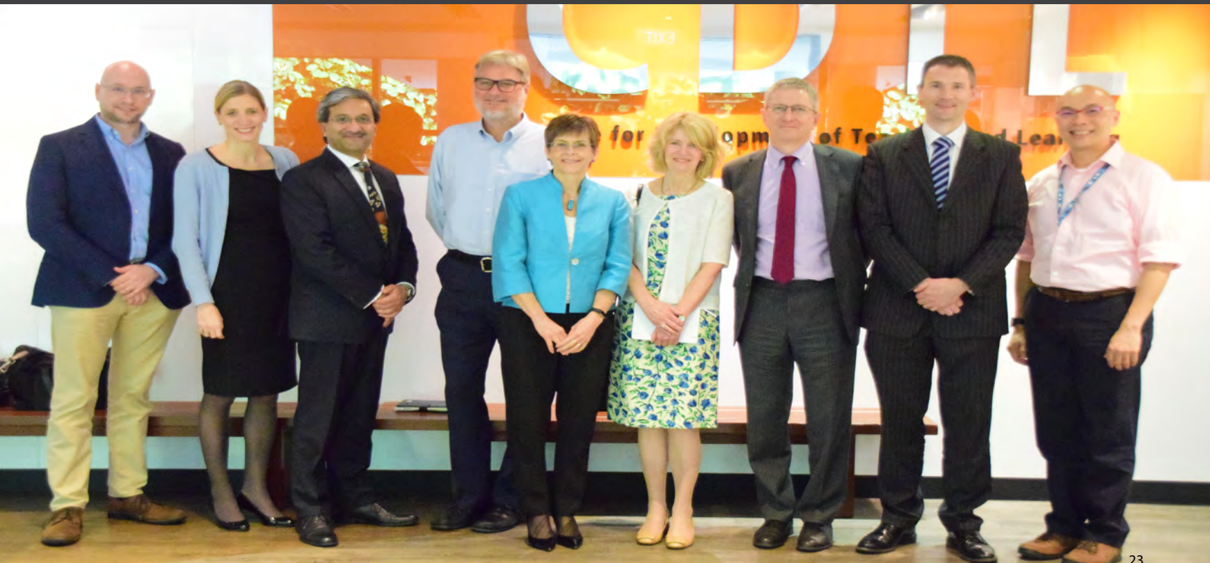
Brunel University London, United Kingdom