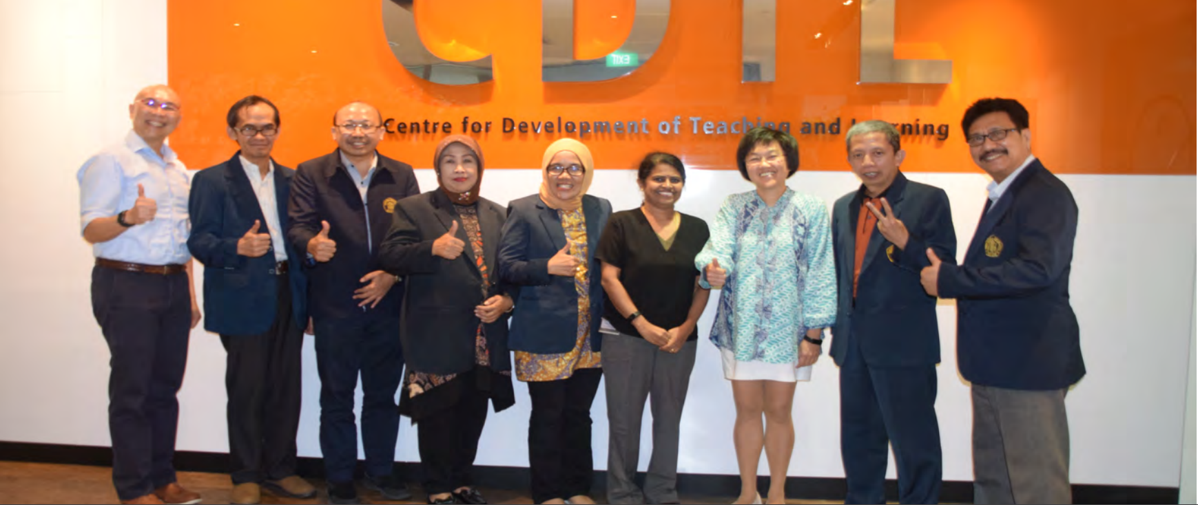
Universitas Brawijaya, Indonesia